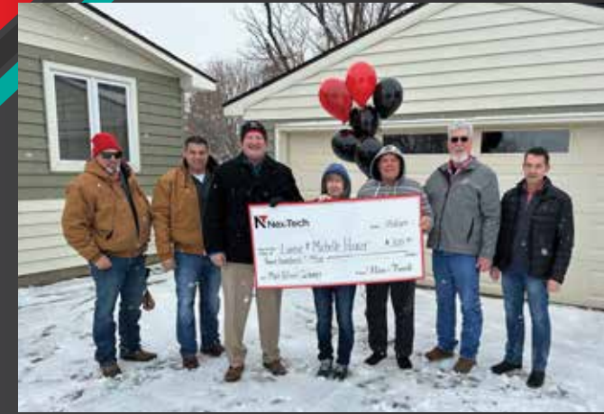
Nex-Tech finished the fiber construction in the rural exchanges recognizing the final cutover.