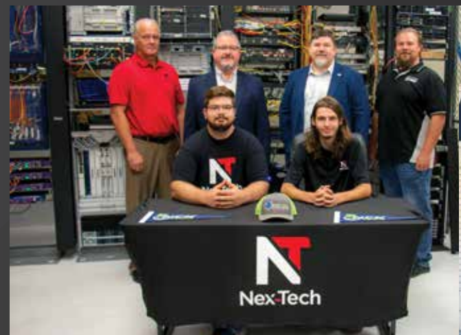
Recipients of the Technology Education Sponsorships at NCK Tech.