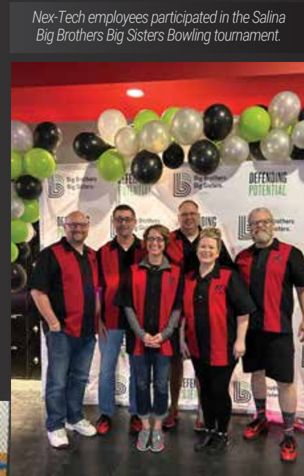
Nex-Tech employees participated in the Salina Big Brothers Big Sisters Bowling tournament.