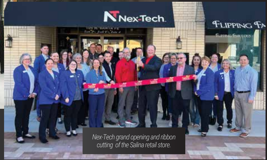
Nex-Tech grand opening and ribbon cutting of the Salina retail store.