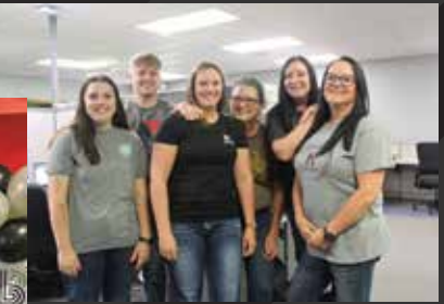
Norton Nex-Tech employees taking a moment on a Friday to rally for a photo.